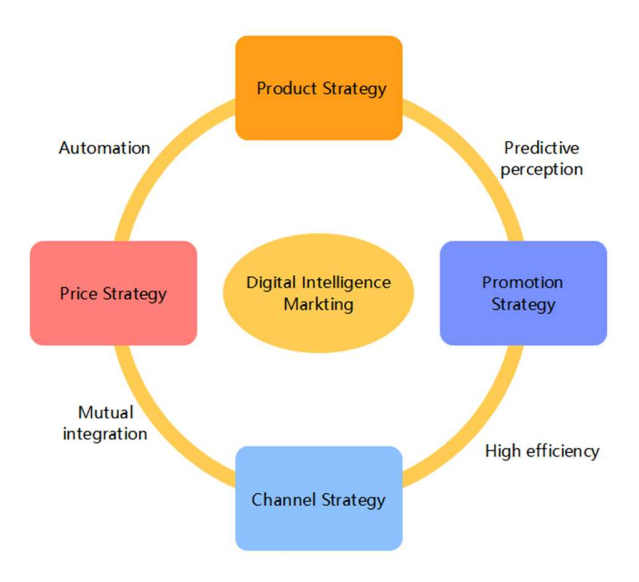
Figure 2: Marketing strategy (4P)

vitality of the product and the enterprise's higher level of profits. At the same time, the consumer receives is no longer the same product, but exclusively one consumer customized products, to achieve demand differentiation to meet. Digital intelligence technology will